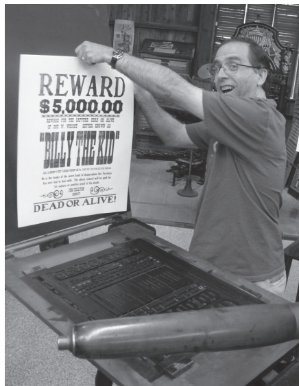
Museum guest printing keepsake on an 1860 Hand Press during Wood Type Day.

of 1787 in the Museum's Heritage Theatre. Ben Franklin and James Madison help the delegates reach decisions on issues, resulting in the signing of the Constitution.