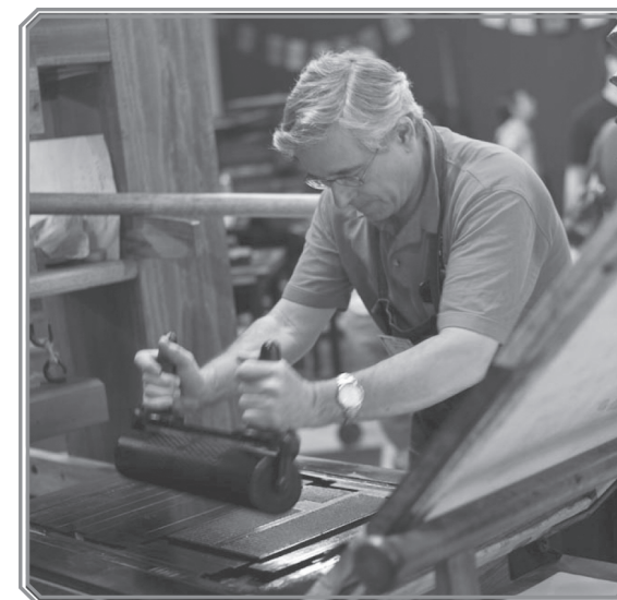
© AIGA Flickr - Los Angeles Printers Fair

You can pre-purchase tickets at www.printmuseum.org . Cold drinks will be available for sale. No food will be served but cold drinks will be available for sale.